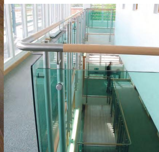
Above: Timber and stainless steel balustrade with glass infill.