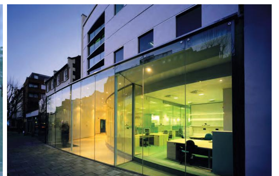
Top Left: Overhead glazing on primary steelwork. Top Right: Underlit laminated glass floor panels with sandblast finish. Above & Left: Bespoke glass entrance and facade on glass fin supports.