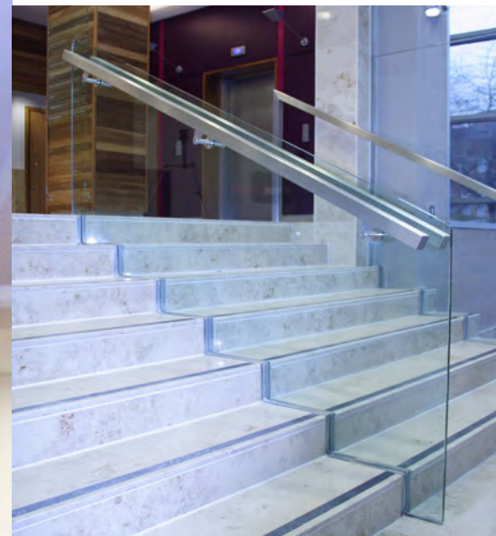
Left: Visually freestanding glass balustrade and applied handrail. Below Left: Nylon system with glass infill. Below Right: Stainless steel handrail and balustrading with glass infill.

Design led requirements and bespoke solutions mean any structural glass style can be accommodated and used in conjunction with stainless steel, a wide selection of solid timber or coloured nylon handrailing.