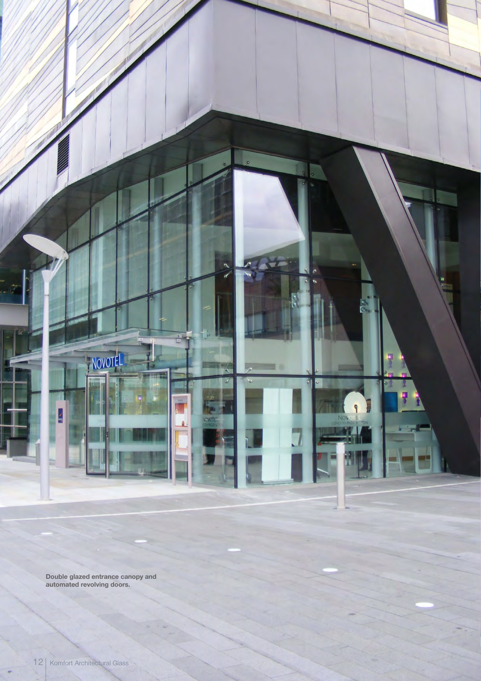
Double glazed entrance canopy and automated revolving doors.