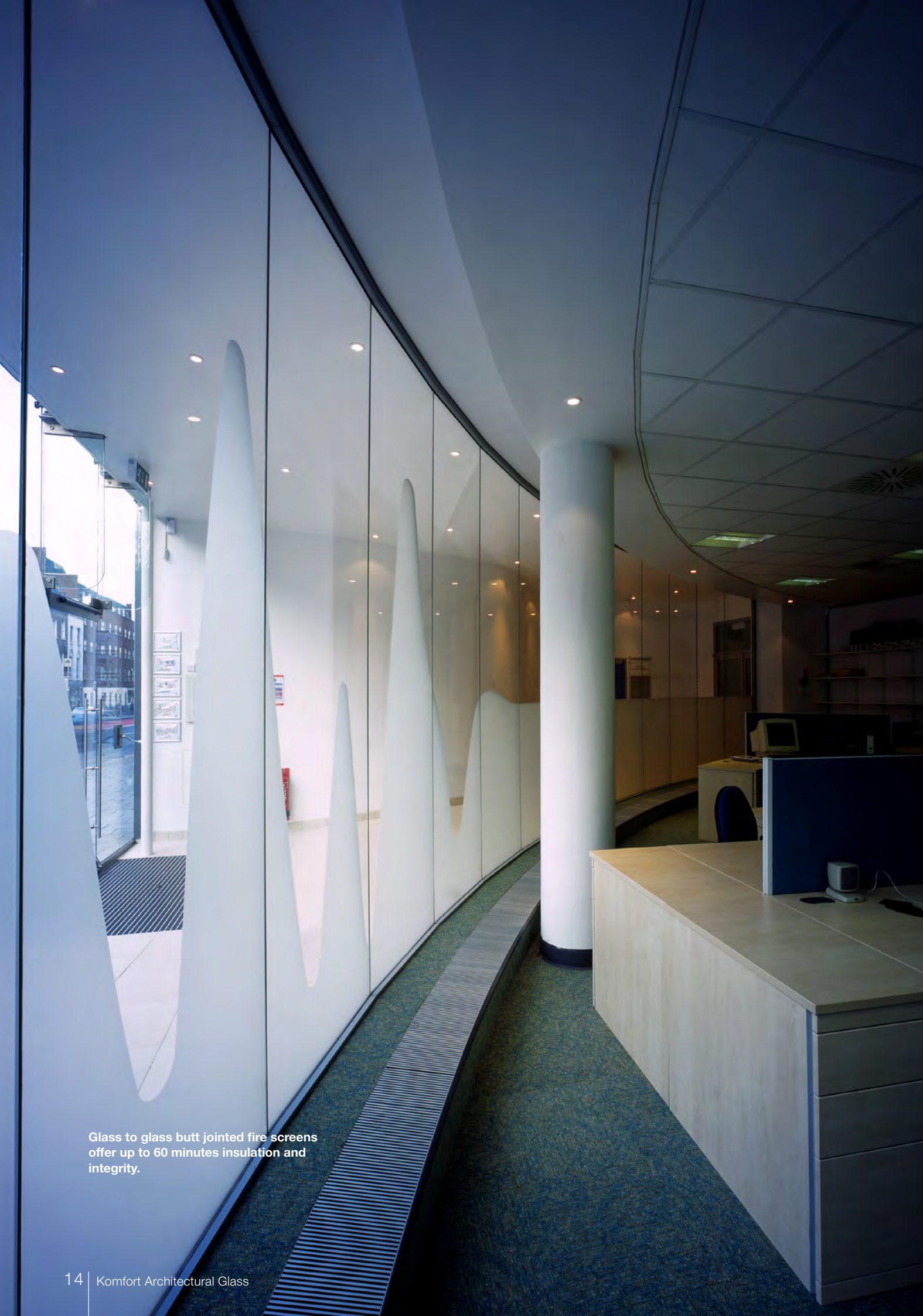
Glass to glass butt jointed fire screens offer up to 60 minutes insulation and integrity.