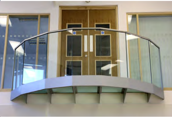
Left: Cantilevered balcony glazing.

Exterior glazing will always need detailed and considered design specification. In addition to the usual structural performance requirements, consideration should also be given to both thermal control and solar control as well as any necessary weather proofing.