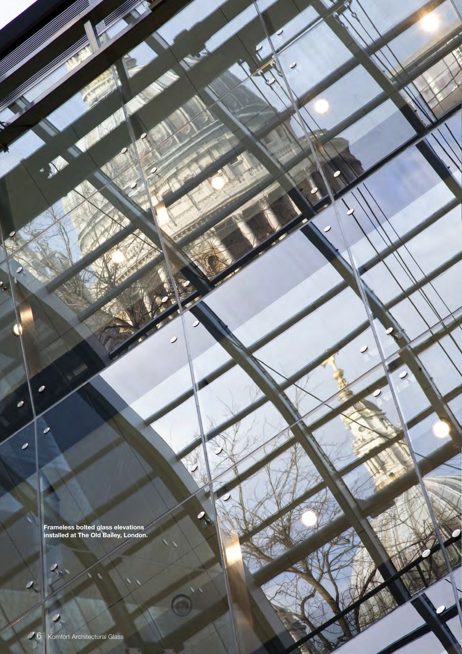
Frameless bolted glass elevations installed at The Old Bailey, London.