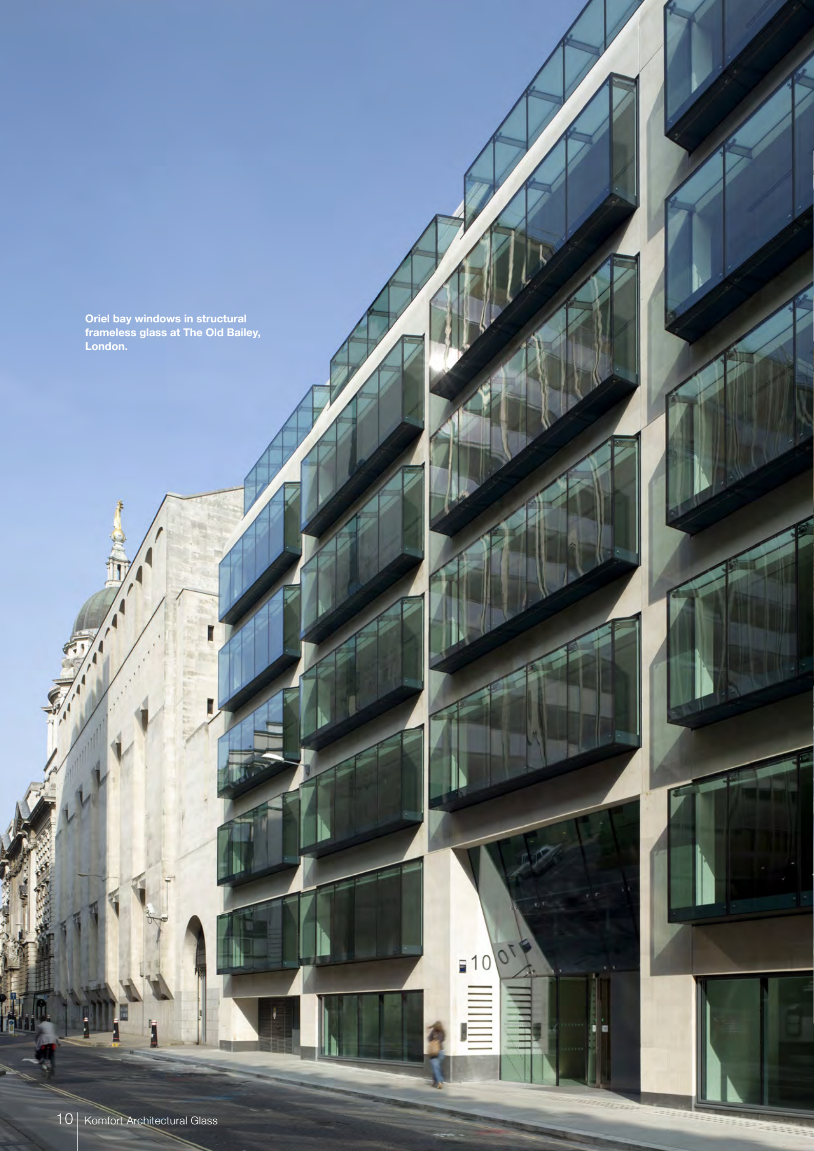
Oriel bay windows in structural frameless glass at The Old Bailey, London.