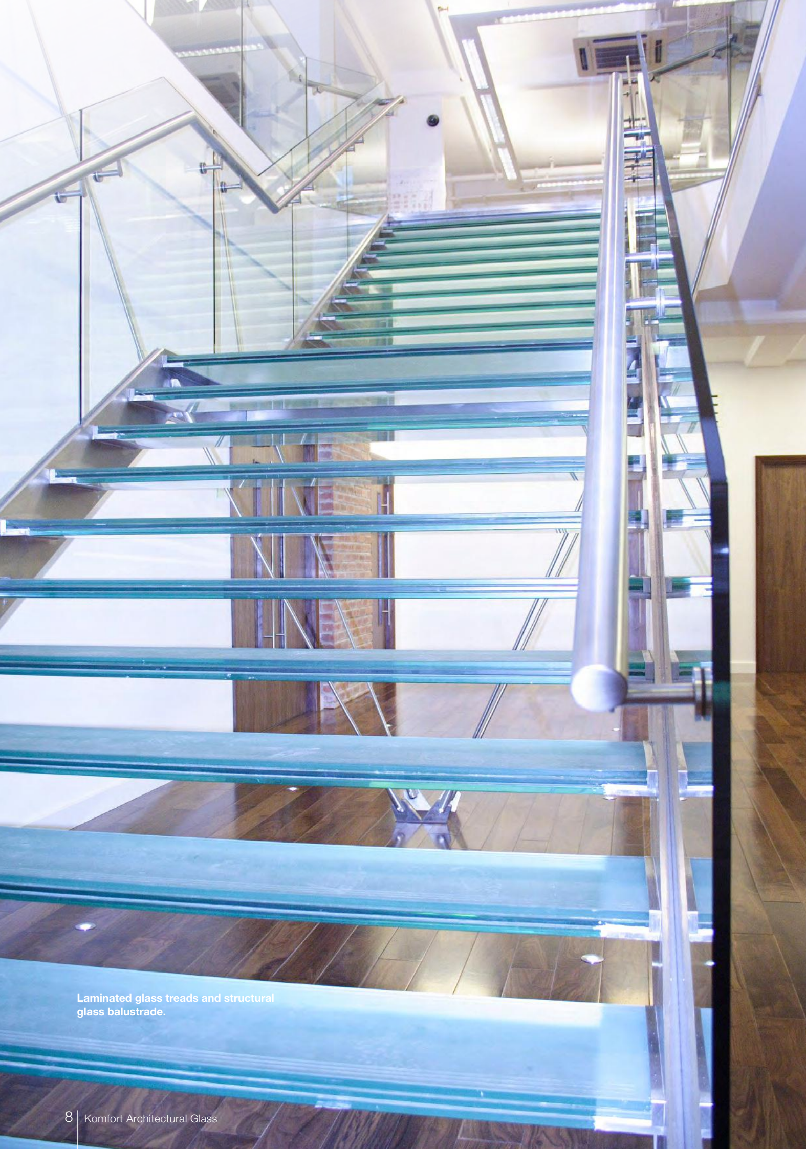
Laminated glass treads and structural glass balustrade.