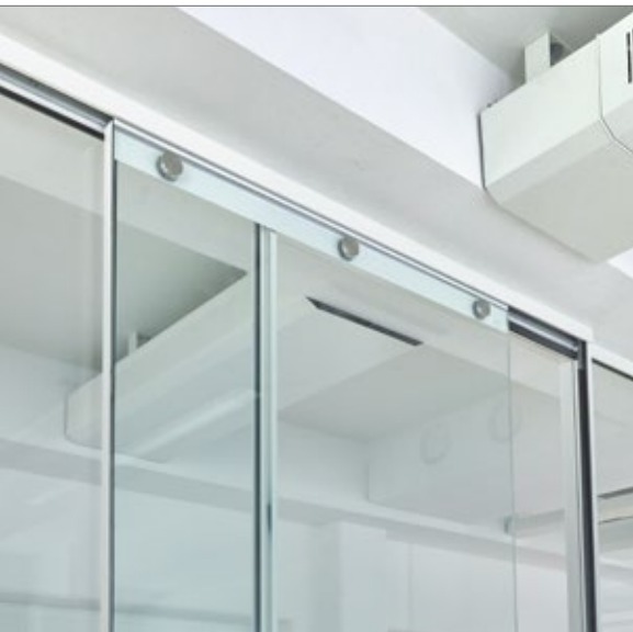
Acoustical sliding door