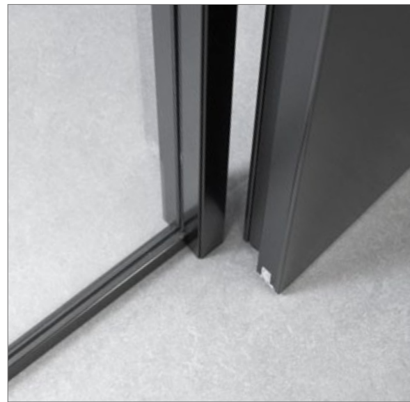
Perfect fit with other steel walls and doors