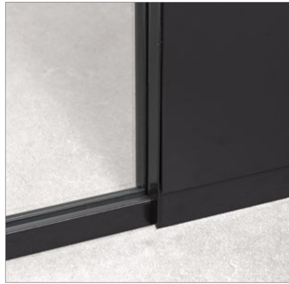
Seamless connection with other Maars Living Walls