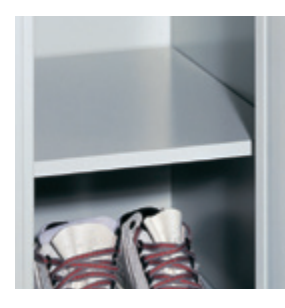
Additional shelf: Installation height approx. 250 mm. Height cannot be adjusted or retrofitted.