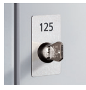
Cylinder lock: Also available with master key function on request. Can be supplied with or without number plate made of plastic or stainless steel.