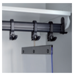
Slot-in hat shelf and special clothes rail: Made of oval profile with twist-proof sliding hooks with system holder, e.g., for coat hangers or a movable partition.