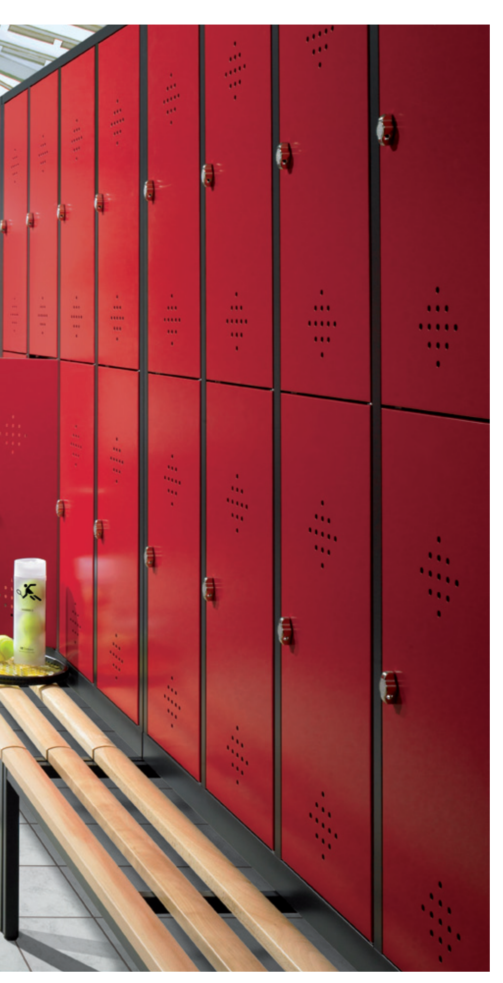
The Classic ventilation concept: It also works perfectly in this locker variant due to the recessed base – and provides much better ventilation than required by the DIN 4547 standard!