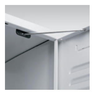
Door opening limiter 90°: Made of stainless steel. Does not limit use of the locker as it is fitted above.