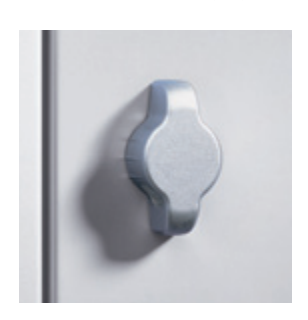
Turning bolt latch: For padlocks with a bolt size of 4.5 to 6.5 mm.