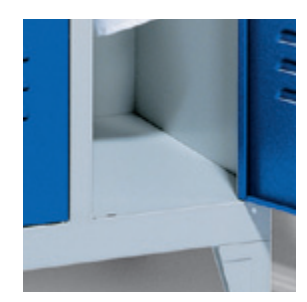
Compartment bottom can be swept out easily: Models with built-in and lowered bench have cleaning openings instead.