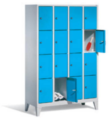
The right design for everyone:

Classic assembled box lockers are available in three different box heights and two different compartment widths.