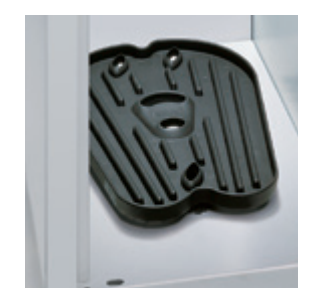
Shoe tray: Made of plastic, removable. With bottom spacers.