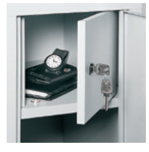
Interior security compartment: Instead of the hat shelf. With cylinder lock. Available for compartment widths 300 and 400 mm.