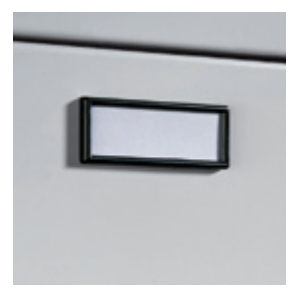
Label holder: Made of plastic, self-adhesive.