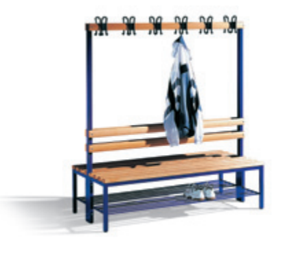
Matching benches with coat rack: Made from a durable rectangular steel tube with comfort hooks and optional shoe rack.