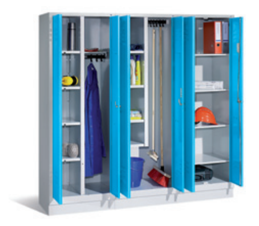
For laundry and cleaning equipment: The laundry locker, cleaning equipment locker, and storage locker fit together perfectly.