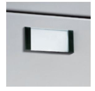
Special label holder: Made of transparent plastic. With this project solution, only the compartment user can change the labeling from the inside.