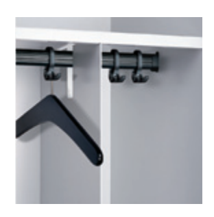
Partition: Made of steel, in a permanently mounted design below the hat shelf.