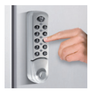
PIN code lock: The simple solution with freely selectable PIN code. Ideal wherever no keys or data carriers are to be used.