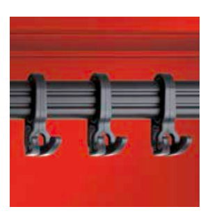
C+P double coat hooks: Oval special changing room rail with twist-proof double sliding hooks. Can support a large load and is very easy to use, with system holder, e.g., for coat hangers or a movable partition.