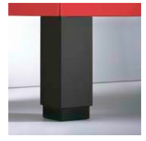
Optimum corrosion protection thanks to optional feet made of plastic: They consistently underpin the linear design and have a protective sleeve that covers the adjusting screw when the optional height adjustment is used. An ingenious feature!