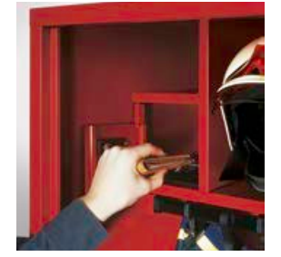
Security compartment with additional top shelf: Important details on model 48315: The security compartment door does not project beyond the housing when opened, thus keeping the passageway clear (= safety even during hectic changing situations).