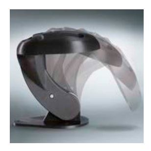
Foldable helmet holder: made of glass-fiber reinforced plastic, for better protection of the helmet by the curved support and practical folding function for society repeats!