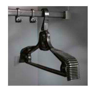
Special coat hanger