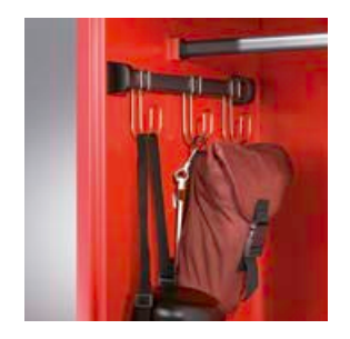
Hook rail on the side: With three additional sliding stainless steel hooks, for example for safety harness, respirator mask, etc.