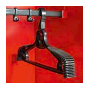
Special coat hanger