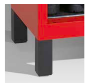
Feet made of plastic