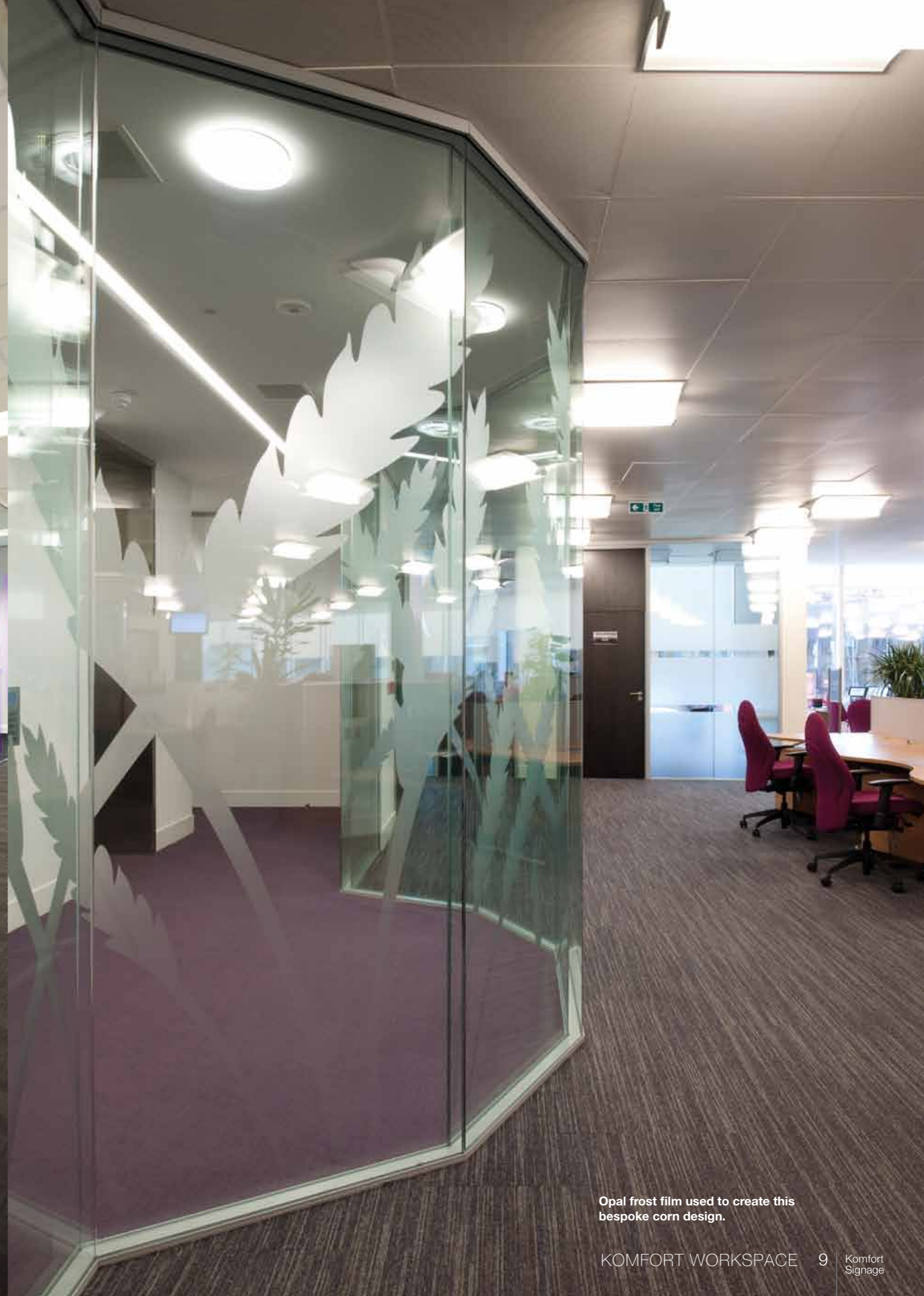
Opal frost film used to create this bespoke corn design.