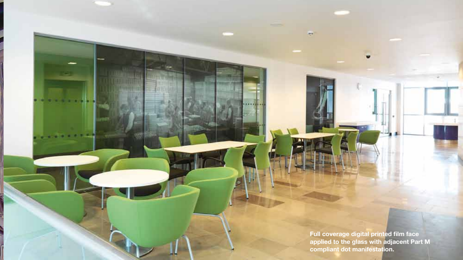
Full coverage digital printed film face applied to the glass with adjacent Part M compliant dot manifestation.