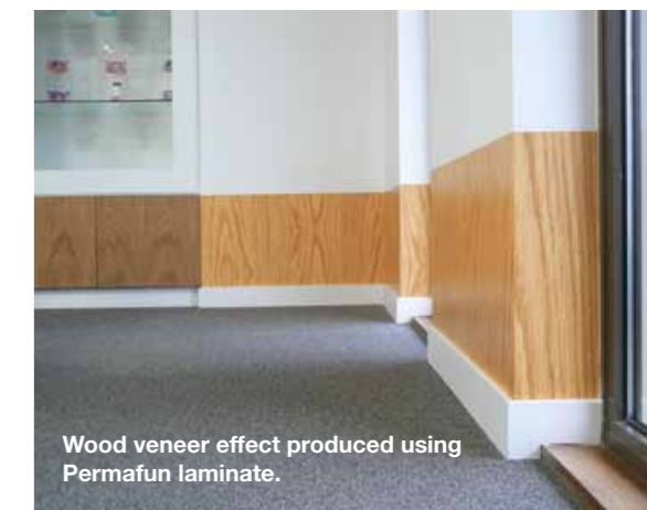
Wood veneer effect produced using Permafun laminate.

Retail and office windows lend themselves to lower transparency graphics to give high levels of visual impact.