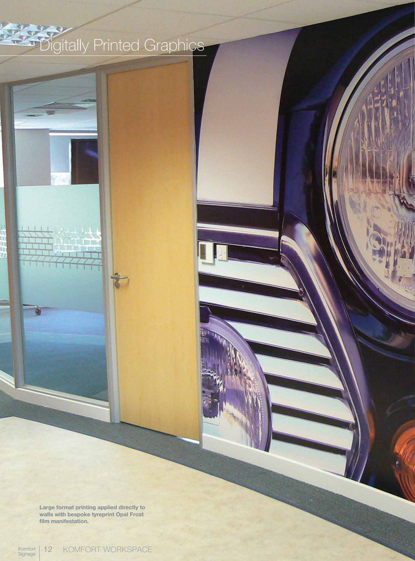
Large format printing applied directly to walls with bespoke tyreprint Opal Frost film manifestation.