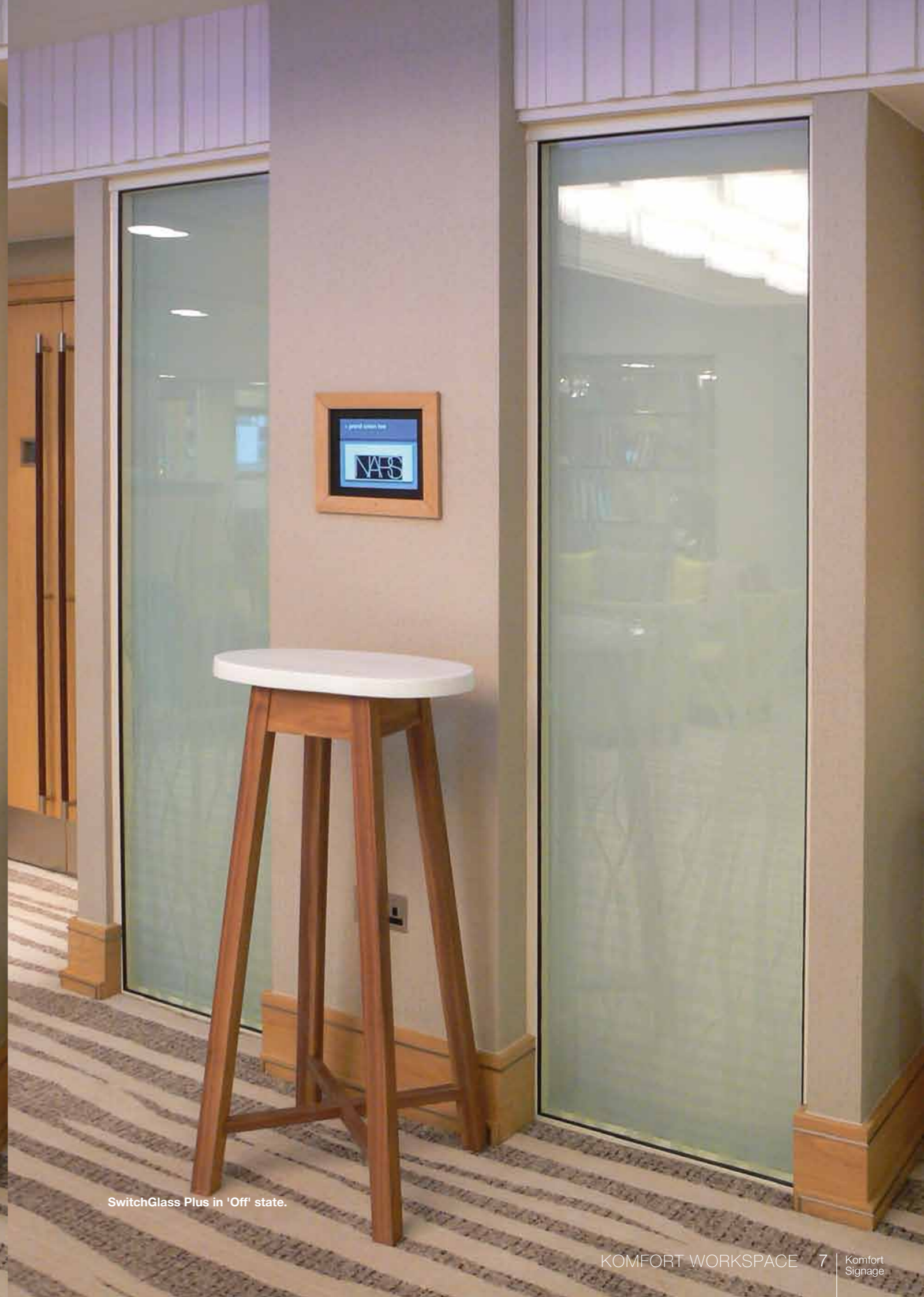
SwitchGlass Plus in 'Off' state.