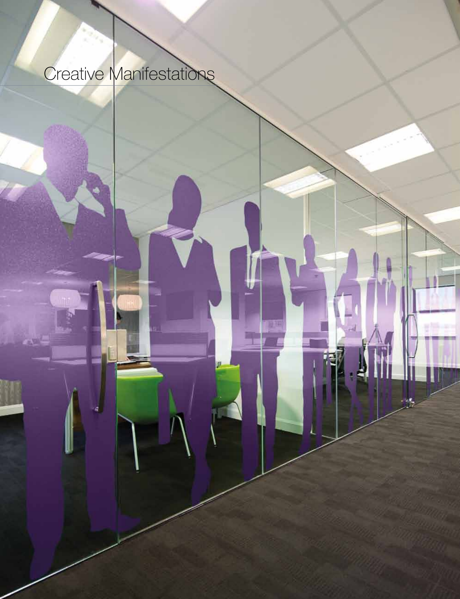
Bespoke cut-out shapes produced using purple tinted crystal film.