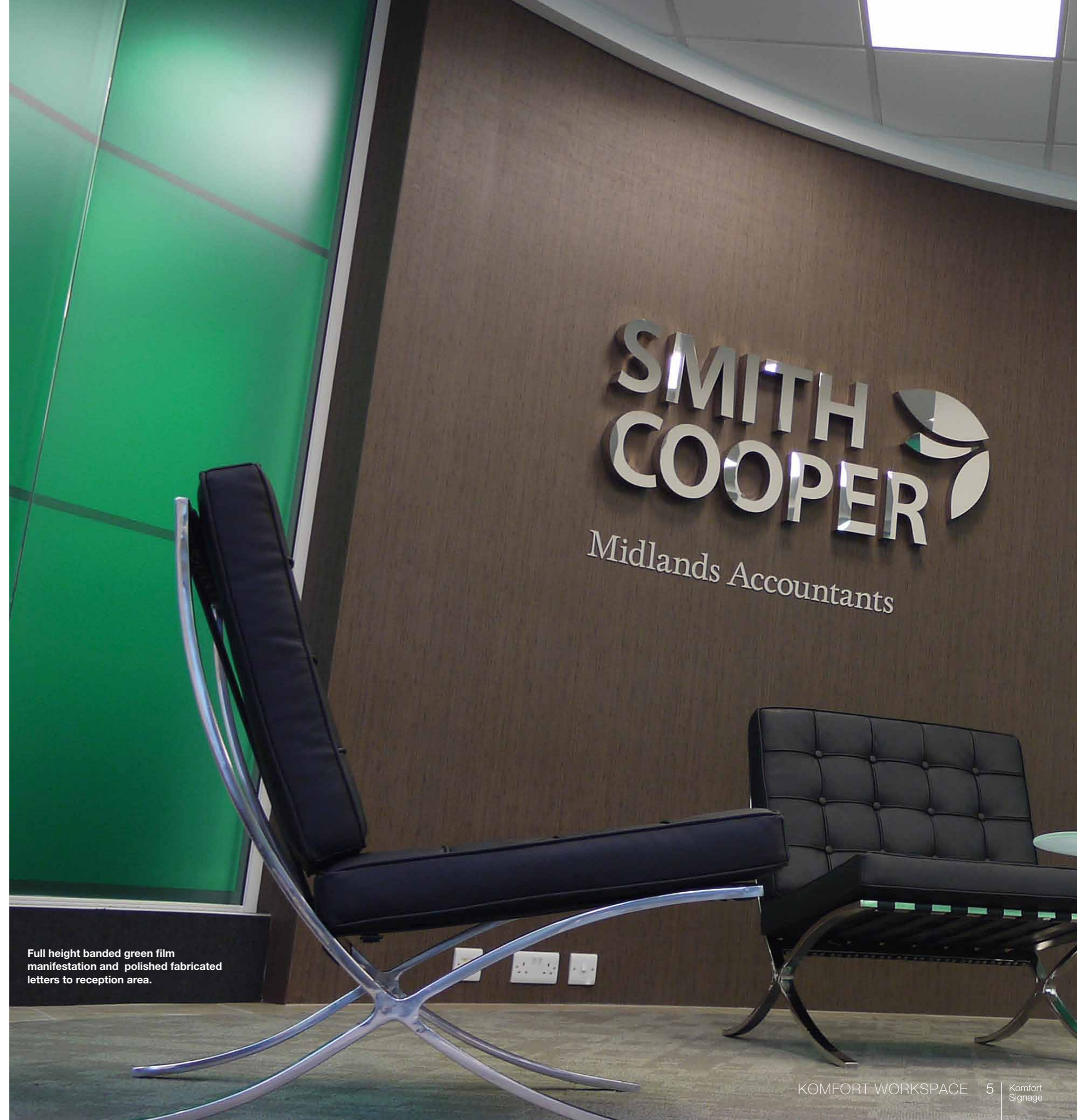
Full height banded green film manifestation and polished fabricated letters to reception area.