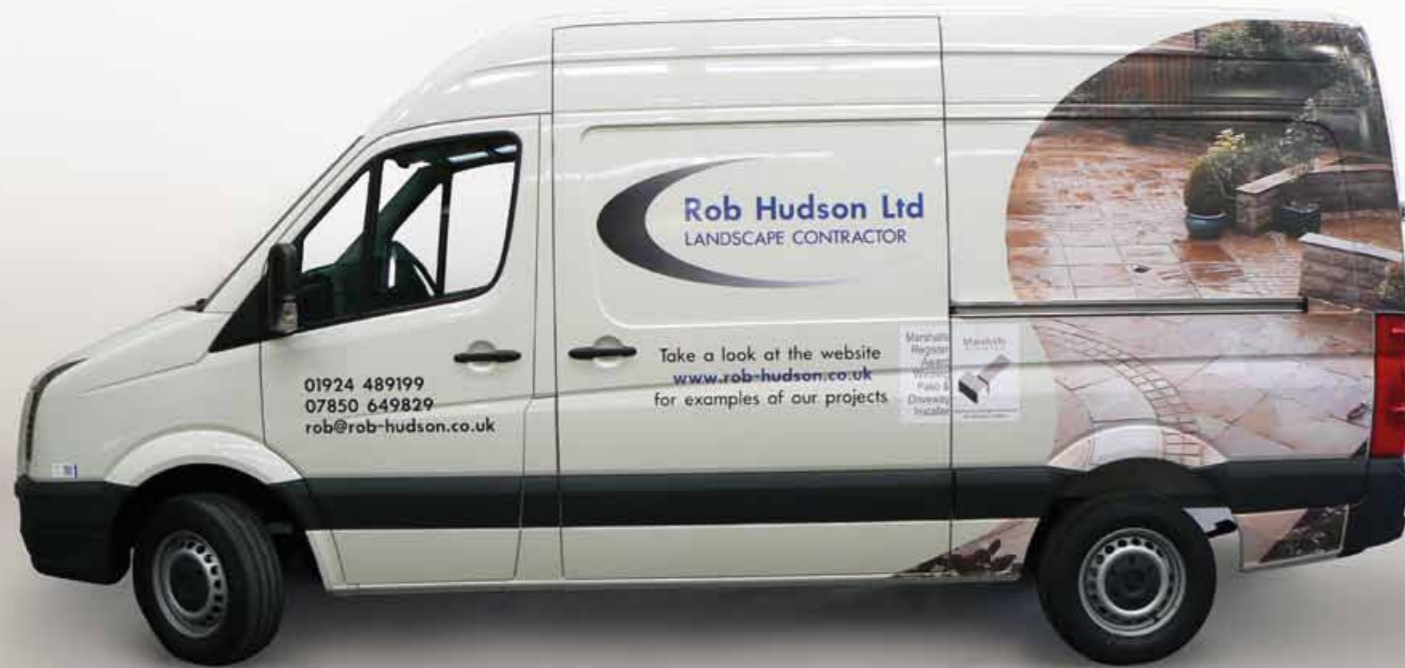
Vinyl text coupled with partial vehicle wrap.