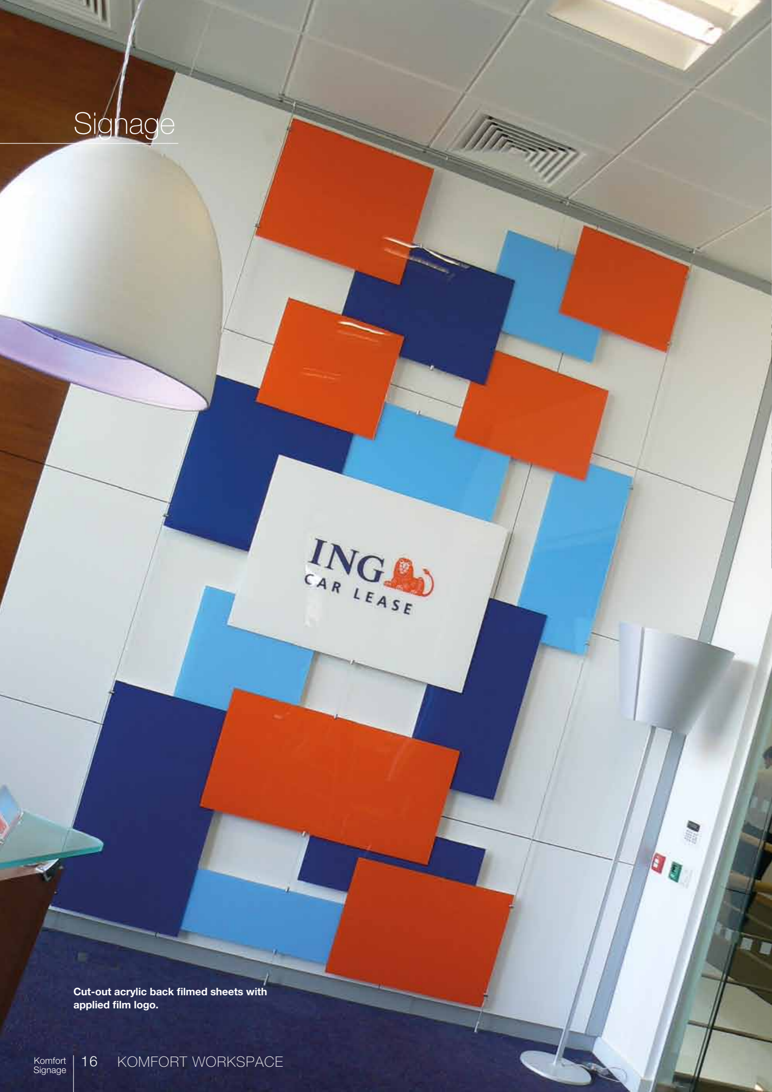
Cut-out acrylic back filmed sheets with applied film logo.