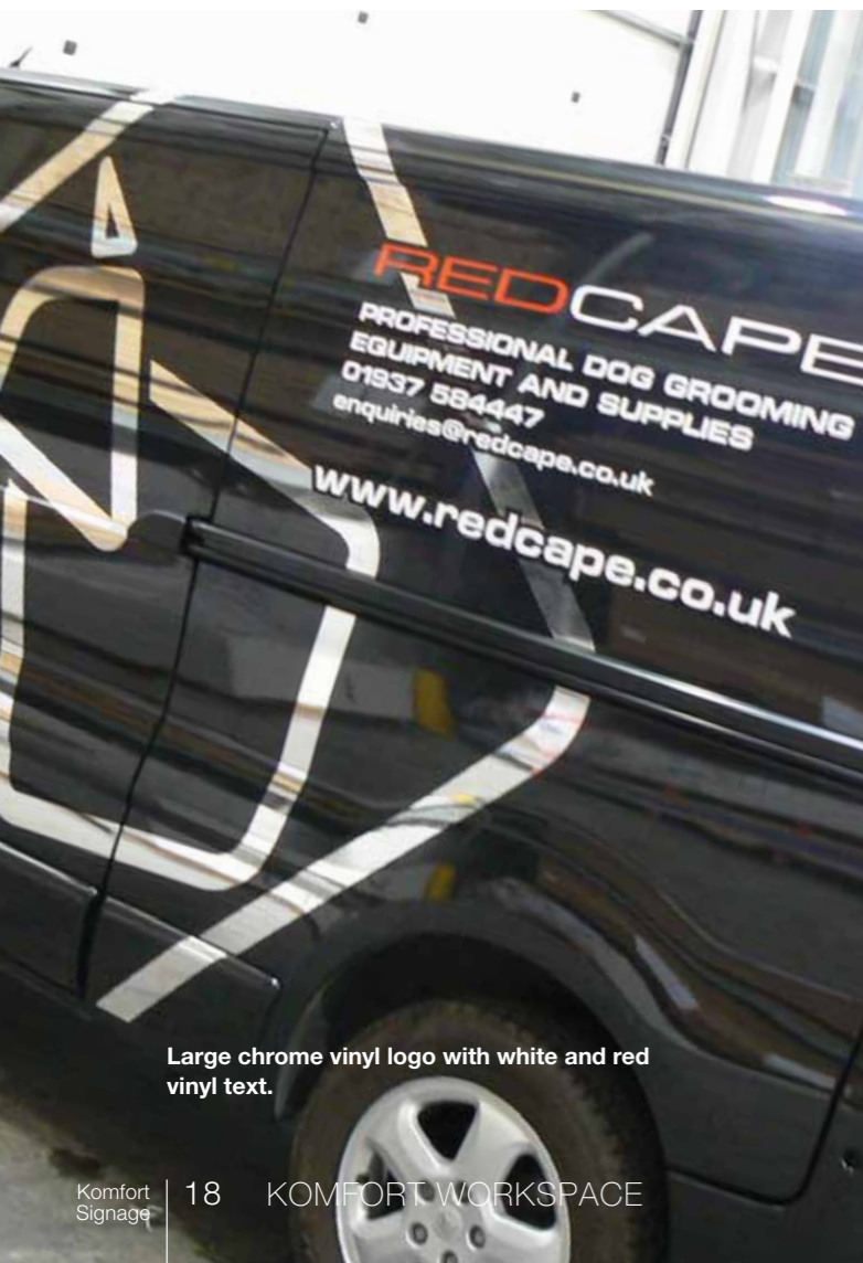
Large chrome vinyl logo with white and red vinyl text.