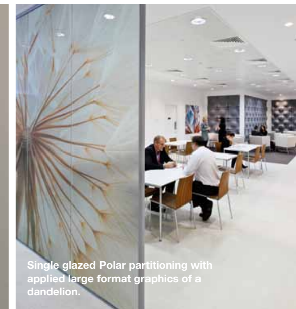
Single glazed Polar partitioning with applied large format graphics of a dandelion.